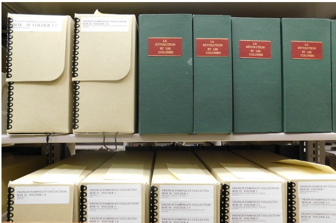
Figure 1 French Pamphlet Storage Boxes

The University of Maryland (UMD) Libraries' Special Collections holds nearly ten thousand French pamphlets, dating from the seventeenth through the twentieth centuries. Many of the French pamphlets were stored in boxes according to subject; perhaps they arrived in College Park in said boxes, or perhaps this system was implemented during earlier attempts to catalogue this collection. Regardless, while the pamphlets focusing on mainland France were organized thematically in uniform boxes, those focusing on the French colonies had been preserved in separate boxes, distinct from the rest of the collection.